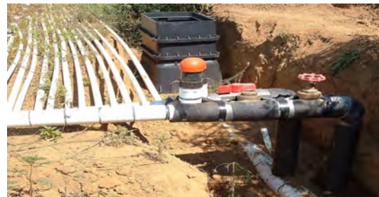
Patent No. 5,984,574

Disc Filtration is an innovative approach to solids removal from liquids. The unique structure allows for high efficiency filtration, low backwash volume, and reusable elements. The discs are flat, grooved plastic rings with a hole in the center. Rings are stacked together to form a cylindrical filter element. As effluent is pressurized into the filter, it compresses the rings. The grooves in the rings crisscross, forming a network that traps solid particles which are larger than the grooves. Filtered liquid exits from the inside of the cylinder providing reliable operation. Disc filters come in a full range of sizes and capacities for the various size systems.